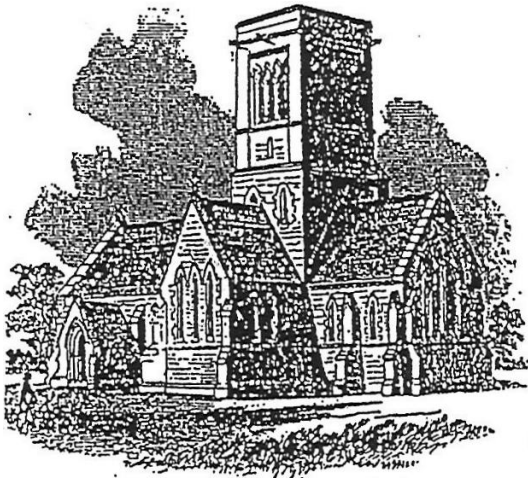
The original Church of 1850 - an engraving from the "Illustrated London News."